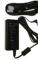
12 Volt Charger